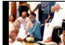
Observing Divine Will

With wonderful Somayaag that occurred at Maheshwar, the holy land sanctified and done in Kolhapur in Feb , 2008, a boost of energy has been received by the entire planet is now, when each Agnihotri has to become a warrior of peace marching on the 5th the torch of Love, living in the Will of Almighty. Time to set aside our personal views, opinions and attitudes and march together in an universe with divine symphony and harmony. The time is "Now".