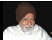
Listening to concerns