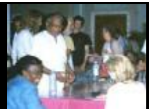
Dinner time after yajnya