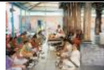
Yajnya and FFP talk-Karnataka